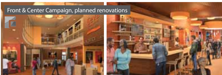
Front &amp; Center Campaign, planned renovations