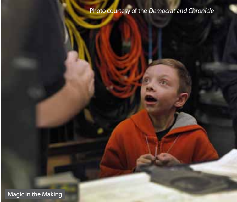
Magic in the Making