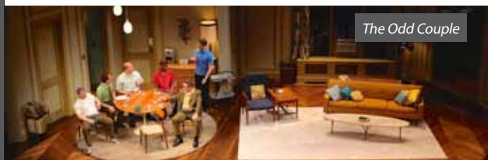
The Odd Couple